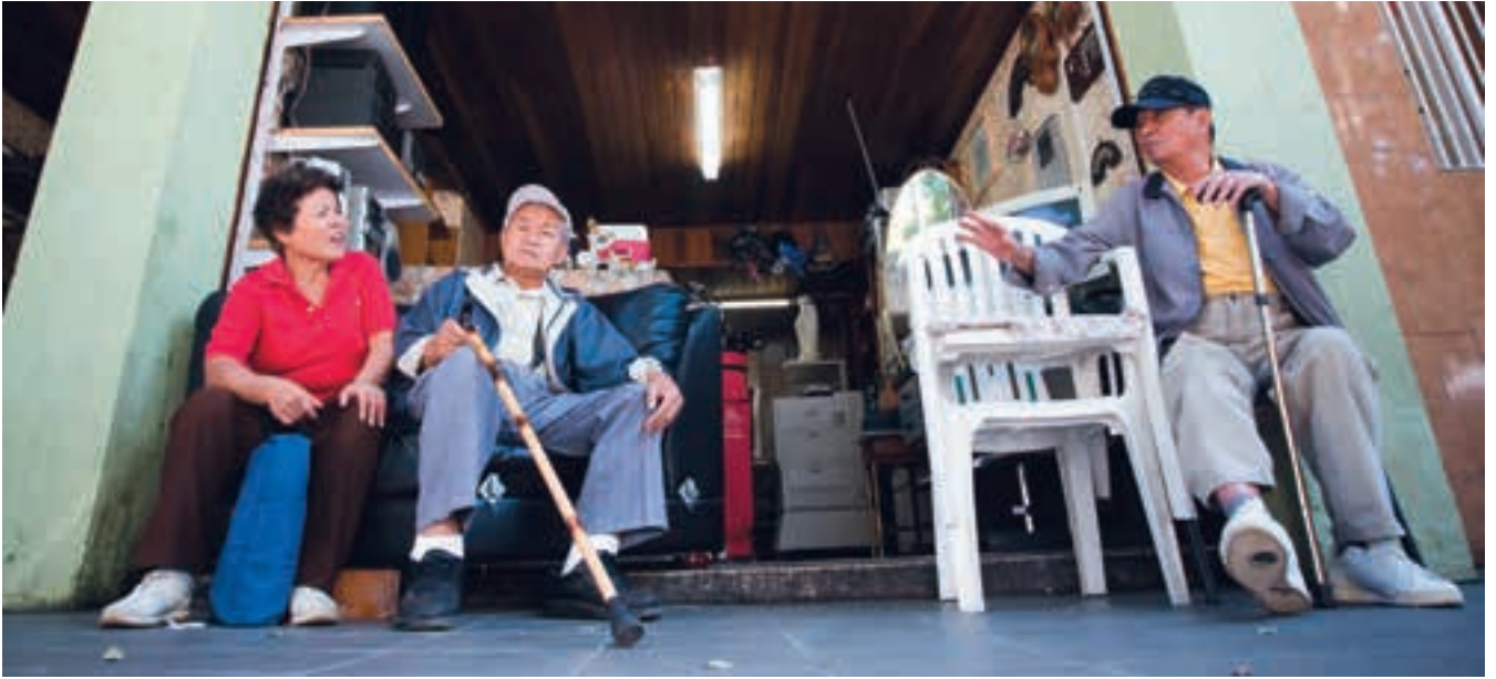
South Koreans in front of a second-hand furniture store in Bom Retiro

amples of this can be found in the region of Franca, which has a flourishing shoe manufacturing industry; Limeira, which has a leading jewelry industry; the furniture industry in the region of Votuporanga; and the hotel industry, supported by rodeos in Barretos. The road network is efficient enough to allow many professionals to live in one town and commute to another town for work, which results in the increase in “population density in small towns previously characterized by a shrinking population.”