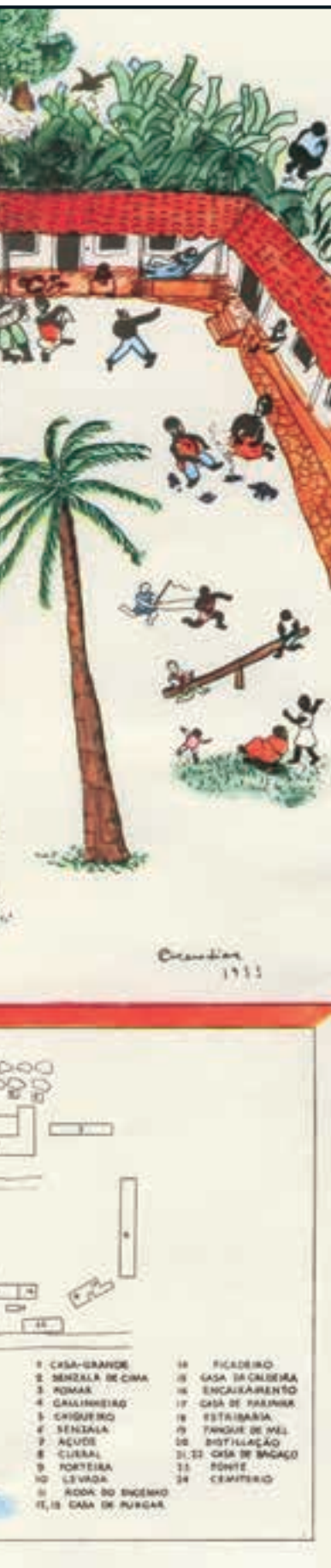
Illustration by Cícero Dias for the 1933 edition of Casa Grande & Senzala (The Masters and the Slaves)

This ambiguity with which Rodrigues saw human nature, and which gave origin to the "saints and scoundrels" of the title, was accompanied by an oscillation of opinions about his work