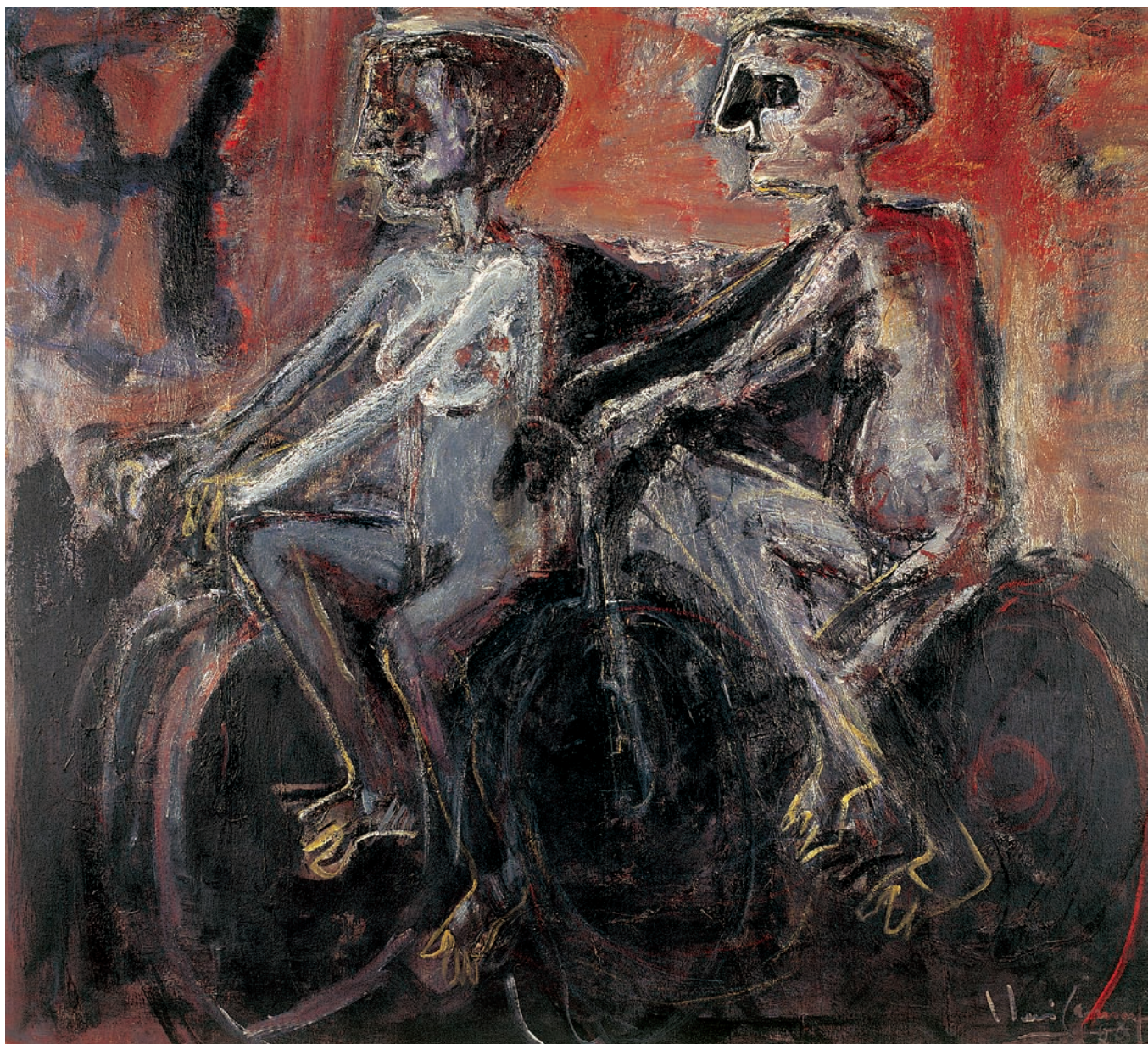
Cyclists , 1989, oil on canvas by Iberê Camargo: autonomy and movement