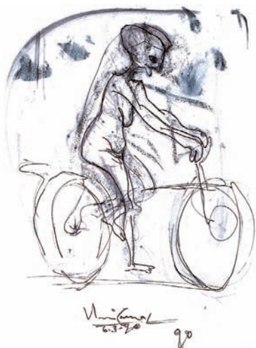
Studies of Cyclists series, 1990, Iberê Camargo

some forms of hallucination common in schizophrenia and in the recovery of patients who had suffered a stroke.