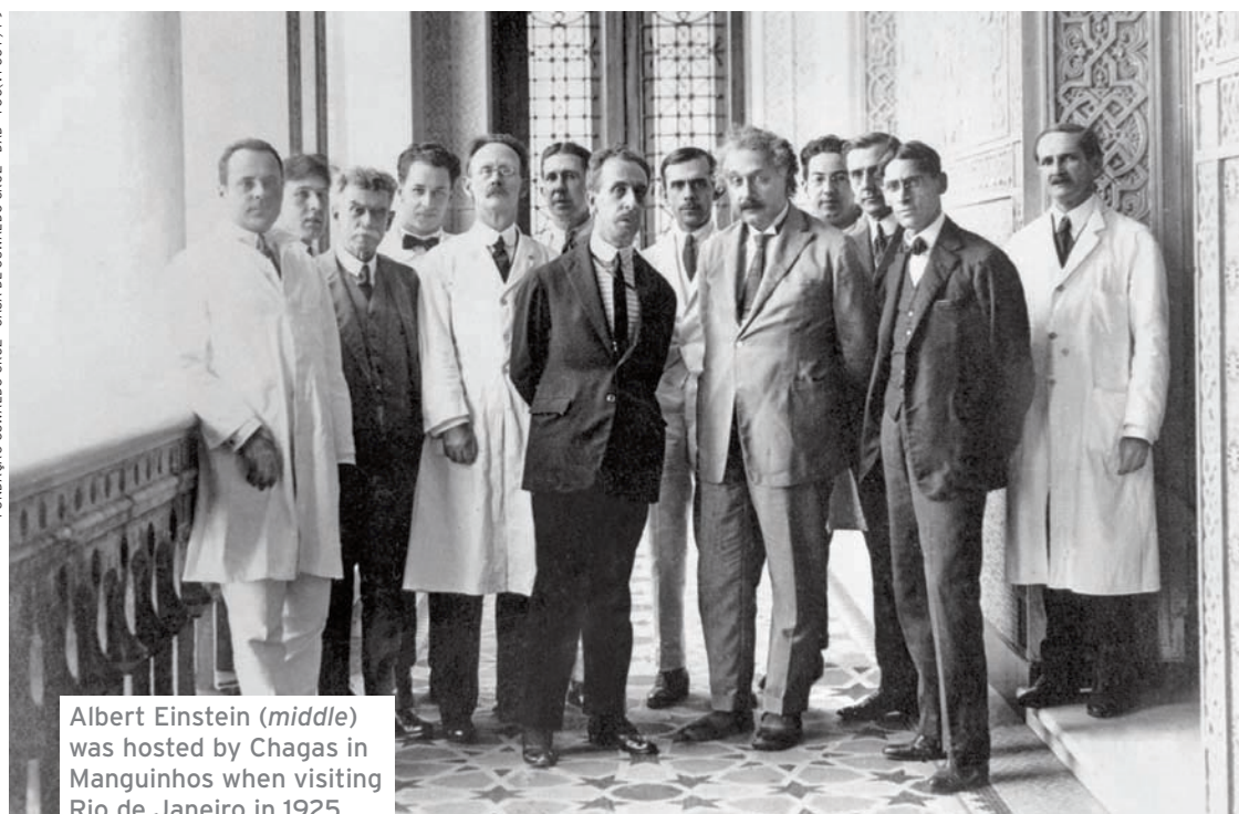
Albert Einstein (middle) was hosted by Chagas in Manguinhos when visiting Rio de Janeiro in 1925