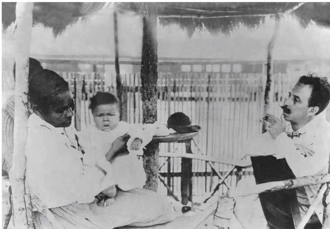
FUNDAÇÃO OSWALDO CRUZ - CASA DE OSWALDO CRUZ - DAD, IMAGEM FOC (F7)3