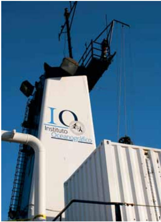
1 A close-up of the ship (above) and crew during the 40-day wait in Seattle while the problem detected in the propulsion shafts was remedied