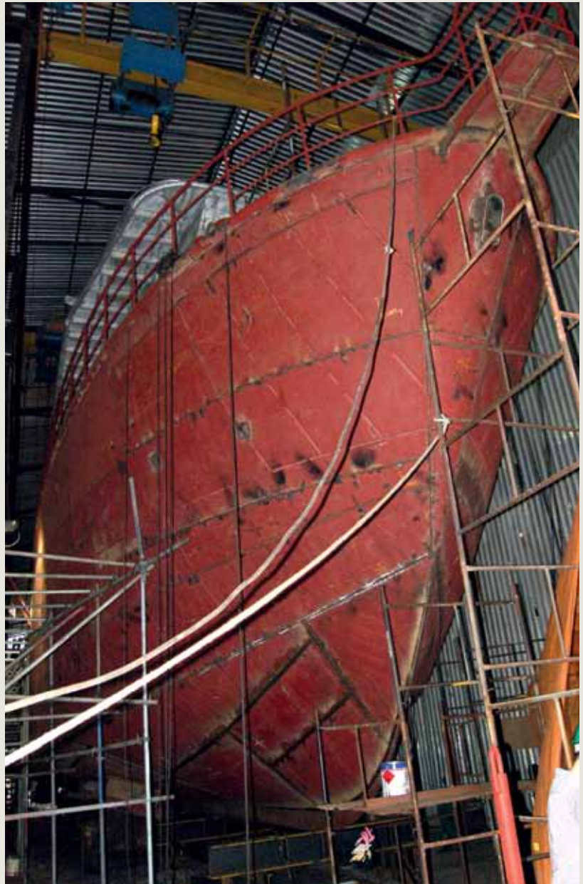
The boat's hull at the Inace shipyard, in Ceará: delivery is scheduled for September.