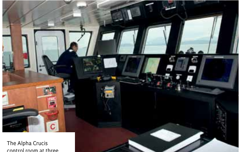
The Alpha Crucis control room at three different times: before the renovation (top left), after the existing equipment had been removed at the shipyard in Seattle (left) and re-equipped (top right). On the previous page, the ship with its former name, Moana Wave