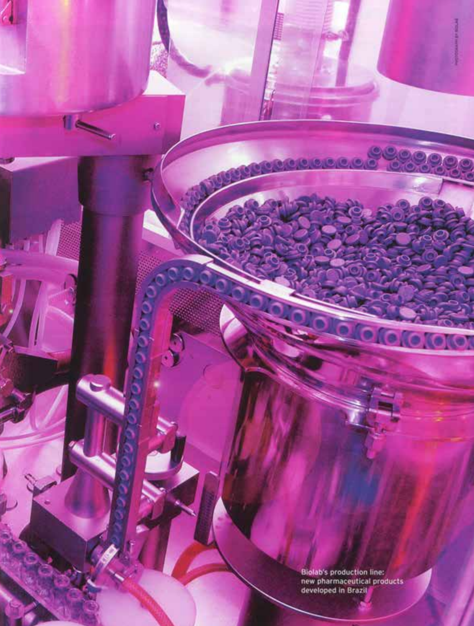
Biolab's production line: new pharmaceutical products developed in Brazil