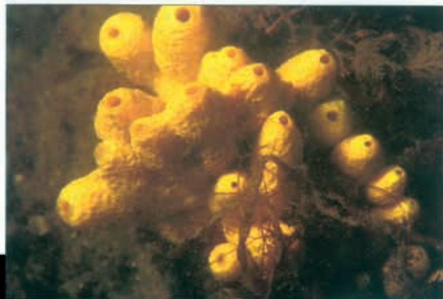
Toxins from sponges show anticarcinogenic properties in tests

will be higher, with the certification of the tests and putting together the dossier that will be forwarded to the Brazilian and international regulatory agencies, for the product to be approved.